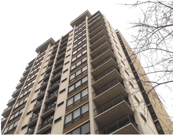
Watergate Condominium, Chicago