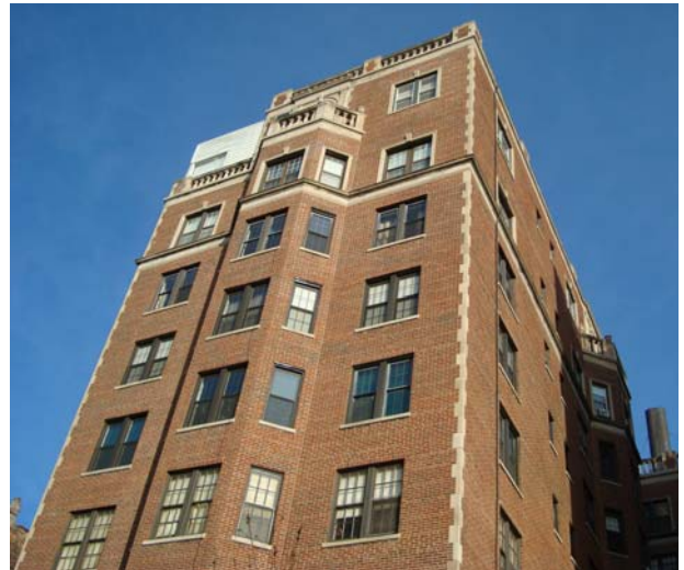
6925-35 S. Crandon, Chicago