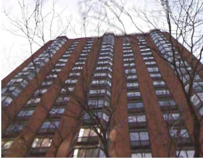
901 South Plymouth Court Condominium, Chicago