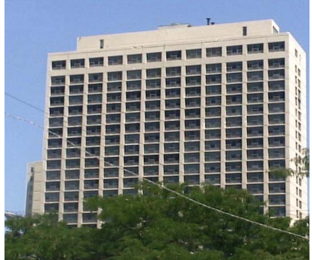
5201 South Cornell Condominium, Chicago