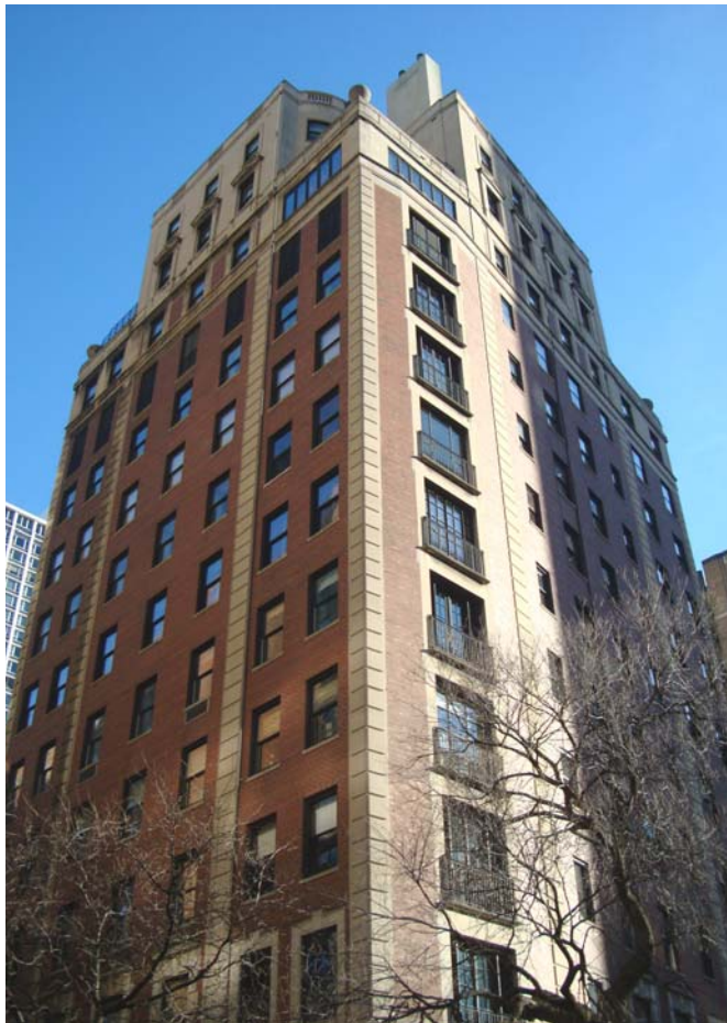
1325 N Astor Condominium, Chicago

HAG provides thorough and competitive Critical Examination Reports and Ongoing Inspection Reports to building owners for their properties, including those listed below for past clients. Our services include standard on-site high-resolution photography & up-close testing of building elements, as well as the use of proprietary digital imaging equipment. These methods provide clients the exact amounts and locations of any building distress onto accurate building elevations for the preparation of our reports. Experience with this work allows HAG to efficiently strategize methods to control the quality and costs of the investigation and any immediate repair work that may be required as a result.