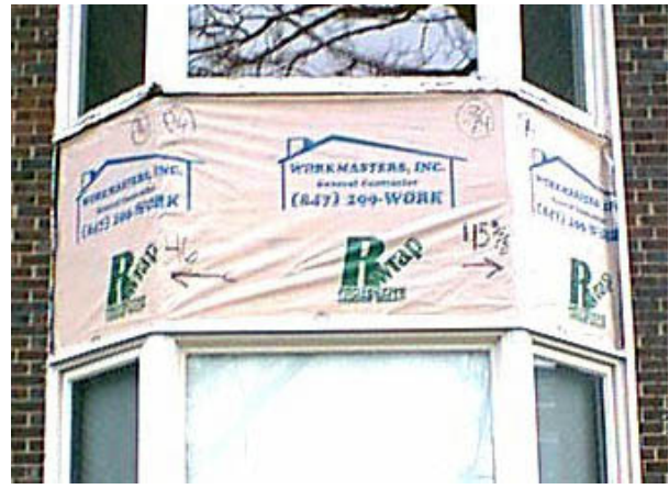
Reconstruction – Bay Window Spandrel Panel