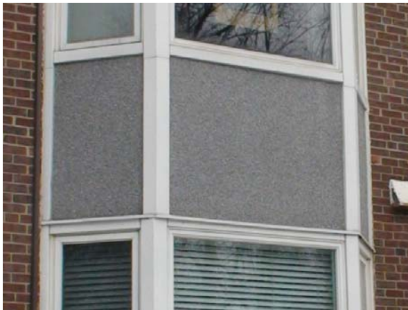
New Bay Window Spandrel Panel