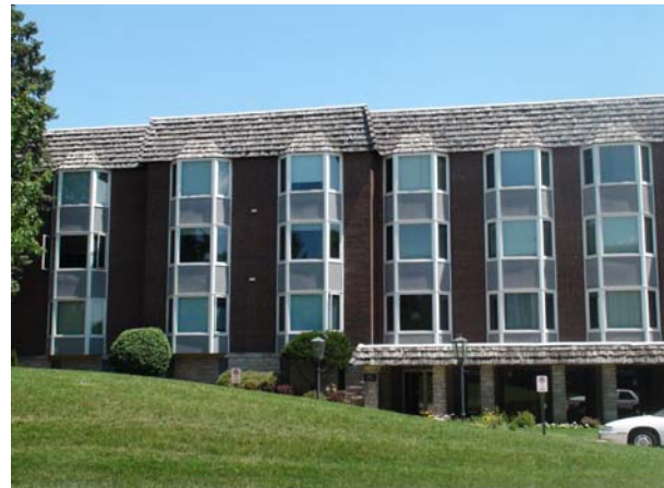
Completed Window/Spandrel Panels