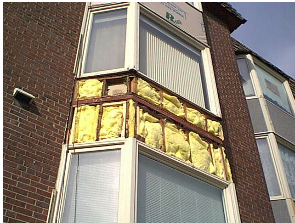
Demolition – Bay Window Spandrel Panel

HAG examined the window systems and their installation to determine the most correct method for replacement. Designs for multi-phased replacement were prepared, competitively bid and permitted. The contractor's two year replacement operations were routinely monitored to meet the highest industry standards of quality and to record the work for the Owner's records.