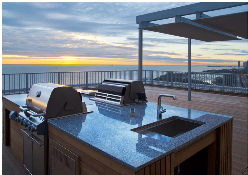
Deck Views of Completed Project (Landscaping for Planters to be Installed in the Spring of 2013)