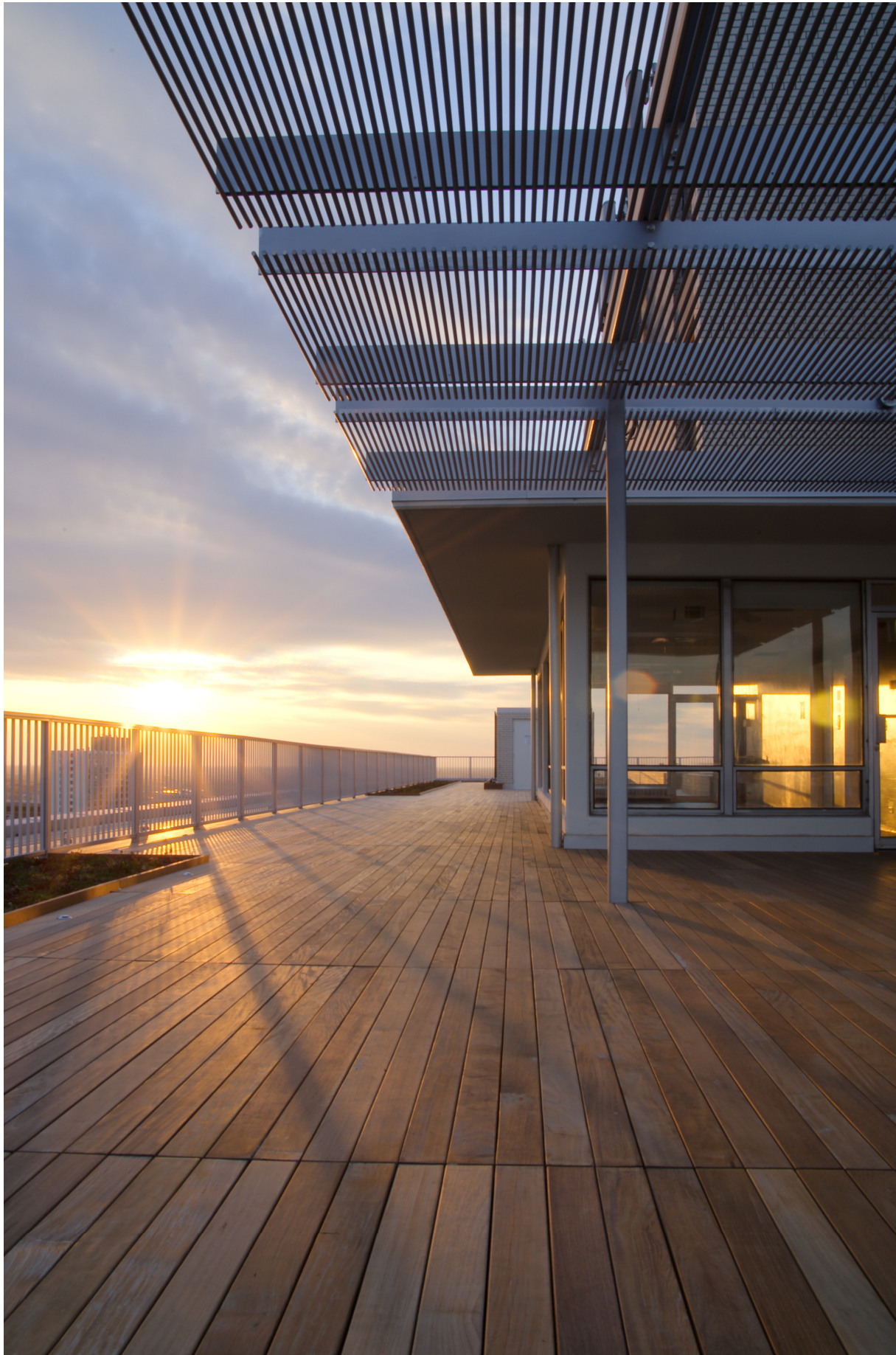
10,000 s.f. Common Area Sundeck Amenity Renovation at 3900 N. Lake Shore Drive, Chicago