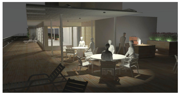
Day and Night Renderings of Design Development Models