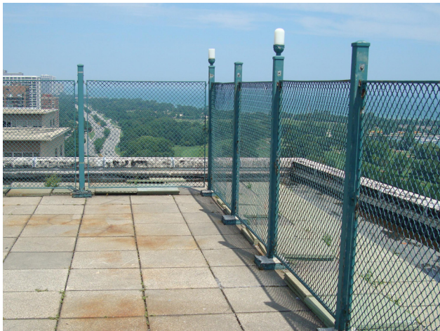
Photos of the Condition of the Roof Prior to Construction