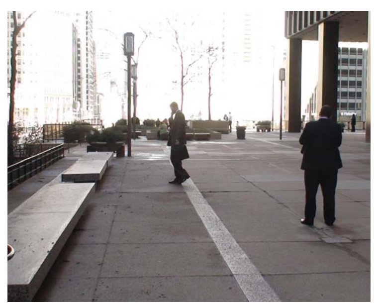
View of Plaza Prior to Construction