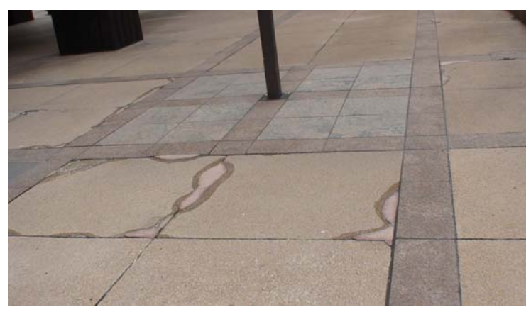
Existing Paver Distress