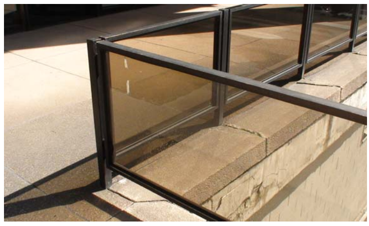
Existing Handrail Distress