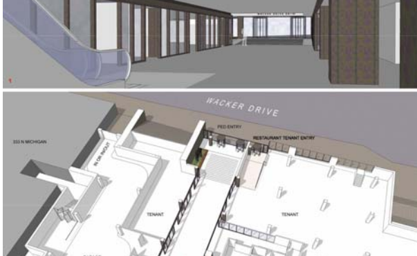
Alternative Conceptual Design Studies for Increased Lease Space (left) & Wacker Drive Pedestrian Access (right)