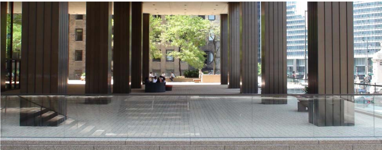
Views of Commercial Plaza after Renovation