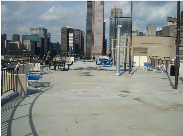
Prior to the Start of Construction