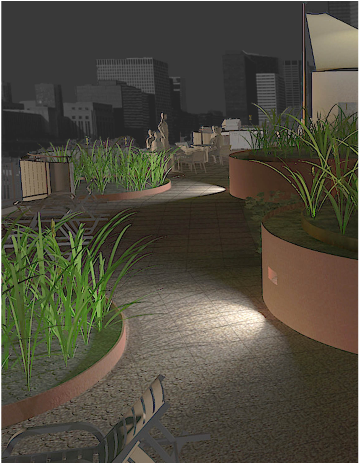
Rendered Night View of Future Completed Project