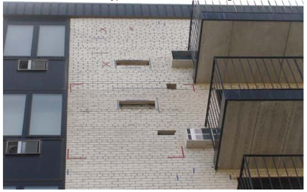
Elevation During Investigation