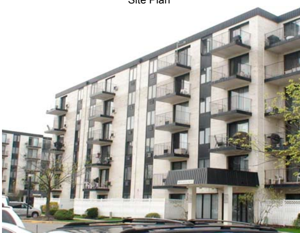
View of Typical Residential Building