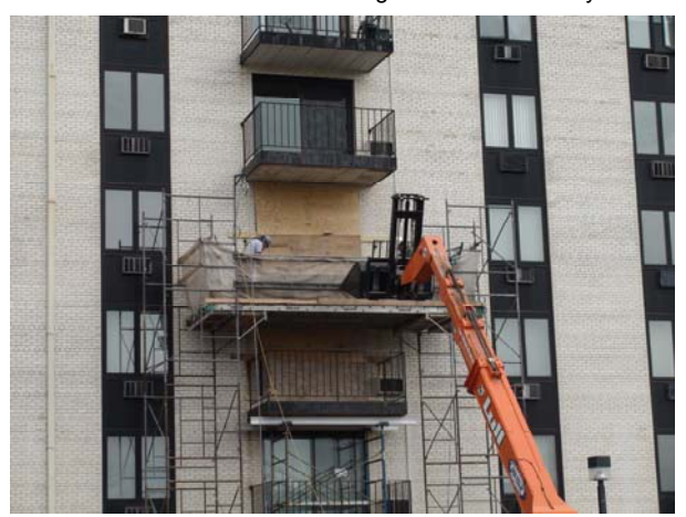
Pouring the Replacement Balcony Concrete Structural Deck