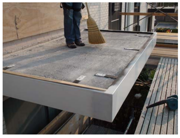
Installation of New Topping Slab and Matching Perimeter Steel