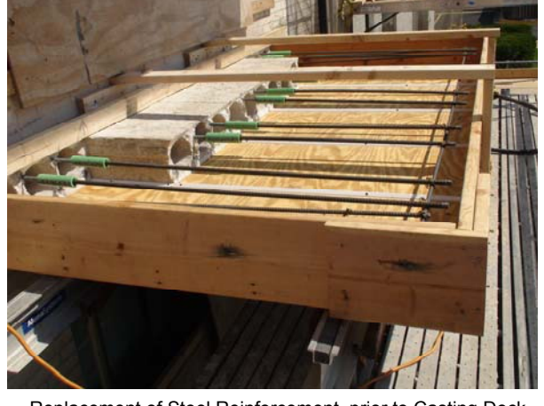
Replacement of Steel Reinforcement, prior to Casting Deck