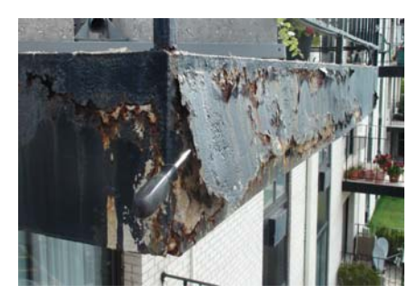
Close-up Photos of Typical Balcony Deterioration