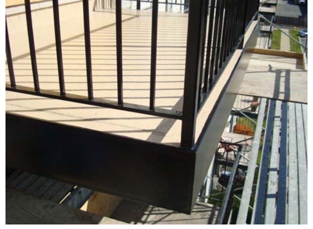
Installation of Prefabricated Replacement Painted Steel Railing